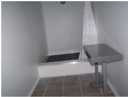
831 8-Station Shower