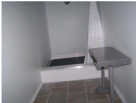
831 8-Station Shower